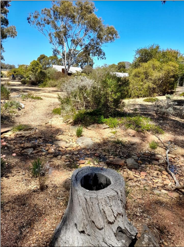
A scene in the Collier garden east of Avoca Victoria, venue of our excursion there last November. An 'ornamental' tree stump leads us over a pebbled watercourse to a meandering path.